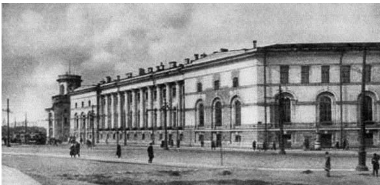
Fig. 2. Early picture of the Museum of Zoology in Saint Petersburg.