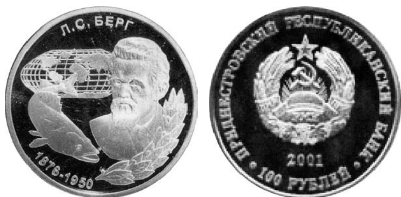
Fig. 6. Bust of the Russian geographer and biologist Lev Sevemenvich Berg, a laurel wreath, a map of the world and a pikeperch. Inscription (with Cyrillic letters) L.S. Berg and years 1876–1950. Mintage 1000 coins. The reverse side of the coin shows the date of minting.

It is now exactly sixty years ago since the death of L.S. Berg. It is timely therefore that the present contribution is dedicated to a scarcely known activity of L.S. Berg, one of the greatest Soviet geographers, whose 125 th birthday was celebrated in 2001. L.S. Berg's impact on geography and biology is indelible, but in fact, as we can see now, he was also an outstanding cultural anthropologist. His biggest contribution in this discipline was his book 'Bessarabia. Country – people – economy', edited in Petro-