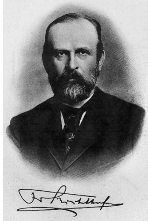
Fig. 4. F. von Richthofen.

"Berg elaborated the study of landscapes and developed the teaching of V.V. Dokuchaev, on natural zones in his works 'Landscape and Geographical Zones of the USSR' (part 1, 1931; 3 rd ed., 1947; part 2, Geographical Zones of the Soviet Union,