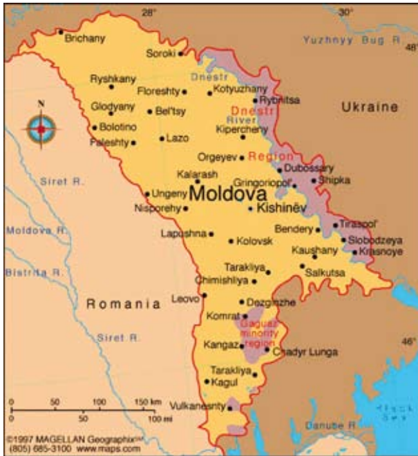
Fig. 1. Map of Moldova (source: Wikipedia, 2009).